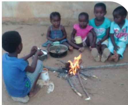
Figure 1: Unsafe domestic environments