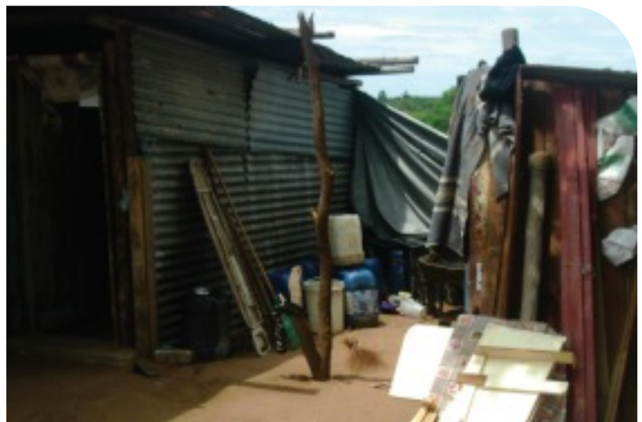
Figure 2: Lack of clean drinking water

PHC Re-engineering iya nkoka ku endla vuxaka exi karhi ka va rhangeri valeka ndzawulo ya swa rihanyo na va rhangeri vale tikweni.