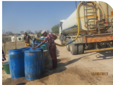
Picture 1: Mobile water truck